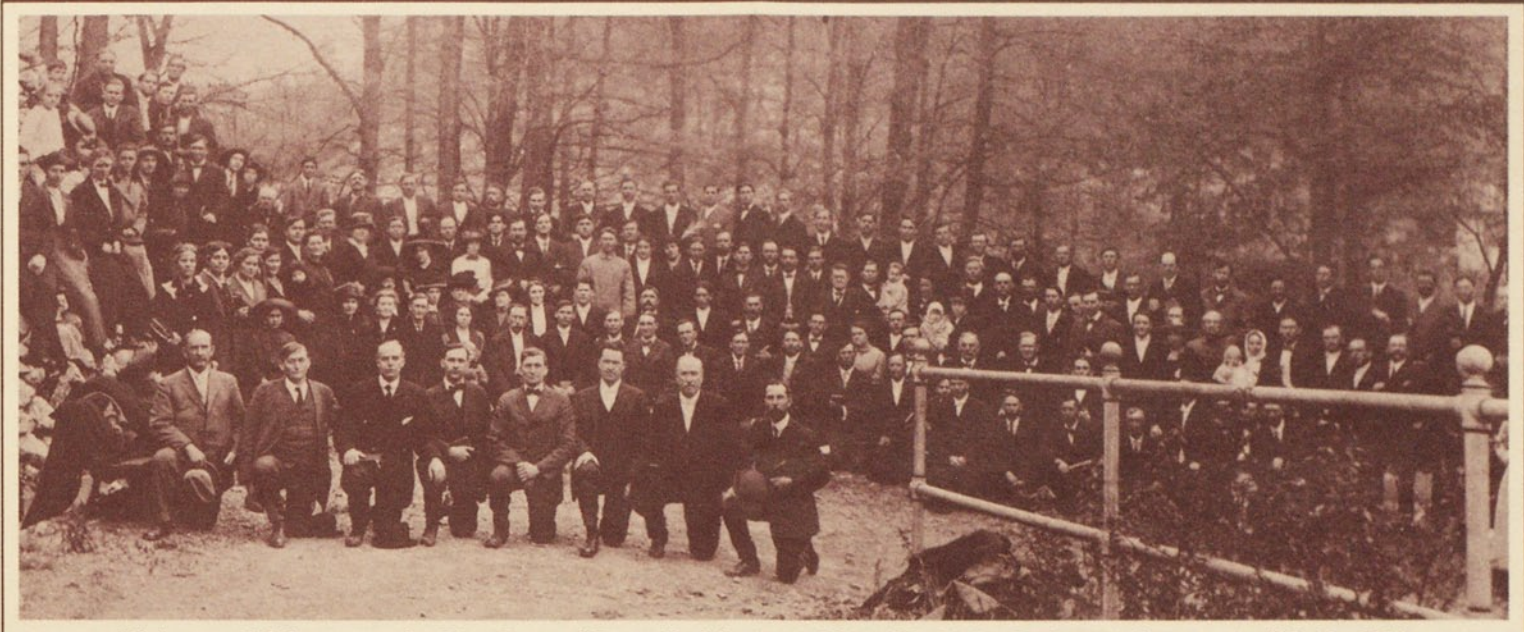
Visitors and delegates at the First General Council of the Assemblies of God, Hot Springs, Arkansas, April 2-12, 1914.