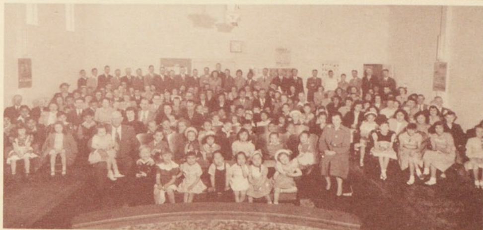
A record-breaking crowd attended the morning worship service at the Juneau, Alaska, Assembly of God during the 1952 Alaska Biennial Council.