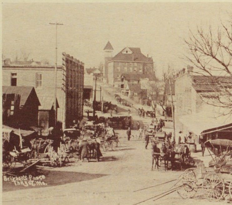
Thayer, Missouri, about 1909

One night the power of God came upon the place, and the glory of the Lord was so great and so wonderful that suddenly we broke out speaking and singing in other tongues. All at once the congregation was amazed to hear that over the tent there was another chorus, the heavenly chorus, that had joined in with our singing. It brought such a sense of God's presence upon the town that the next night the tent was jammed to the doors. Everyone was asking what was