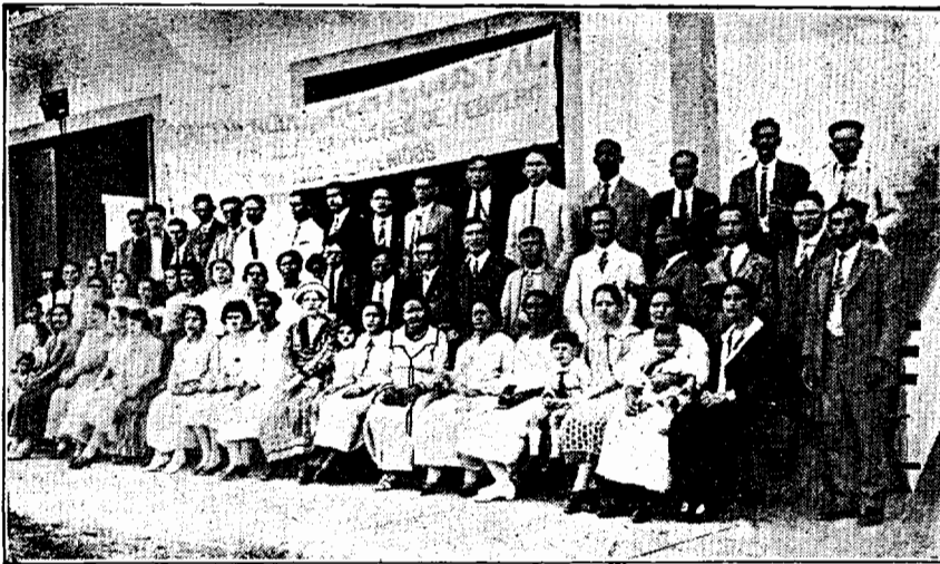
The congregation at Santurce

But as I look back over the past, and remember these things, I cannot help but think, "What a pity that I had to return to America to learn Pentecostal truths." What a waste of precious years! There are many tired, sick, broken-down missionaries and Japanese workers in Japan, but there is not one single rest home of