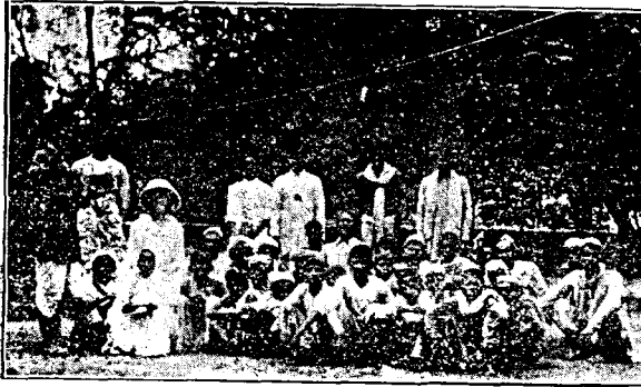
A Sunday morning service at Chappa before the flood came.