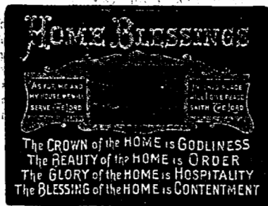
Size, 10x12 inches. Price 40 cents. No. Aa-5501. Corded.