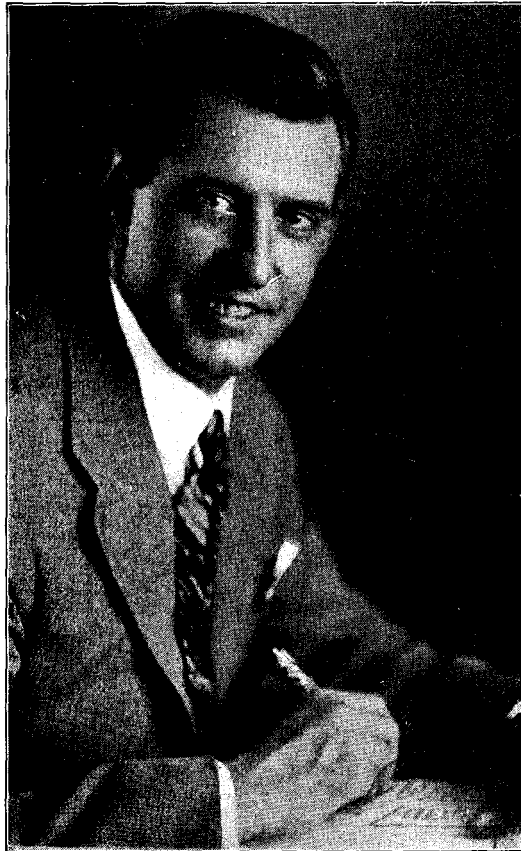
Our Field Editor

For we make Him whom we call "good" a liar, an impostor, a mountebank, a deceiver and an unprincipled, heartless hypocrite every day of His life, every time He disputed with His opposers and whenever He preached to the multitudes, unless we believe Him to have been what He maintained He was. His speech was interspersed with direct and indirect references to His divinity. His claims were unmistakable and unqualified. He pointed to the witness of the Scriptures, the testimony of His forerunner, John the Baptist, the attestation of His miracles as proofs of His Godhead. It was not possible for Christ to be THE TRUTH , the very essence of verity, and to lie